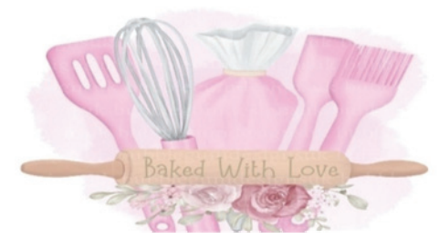
CATHOLIC WOMEN'S LEAGUE FATHER'S DAY BAKE SALE June 16, 2024

The Knights of Columbus will hold a Peameal Bacon on a Bun. We will have food available upstairs at the church entrance and also in the parish hall after the 8:00am and Noon Masses. The cost is a voluntary donation to help support our good works.